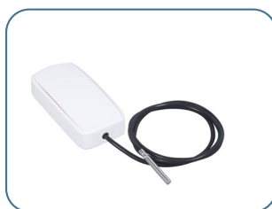
Ivy Temp 2D connected temperature data logger