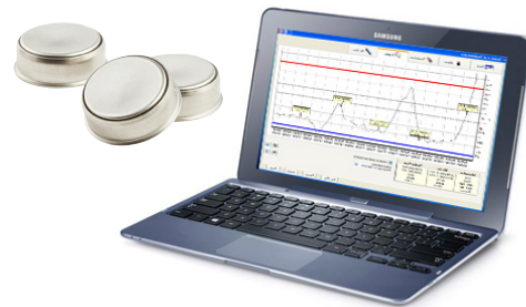
Works with every Thermo Boutons

Simply connect the Button to the reader, to get the graph, the list of temperatures, the list of excursions.